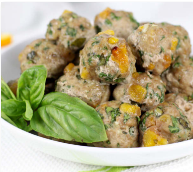
Apricot-Basil Breakfast Meatballs