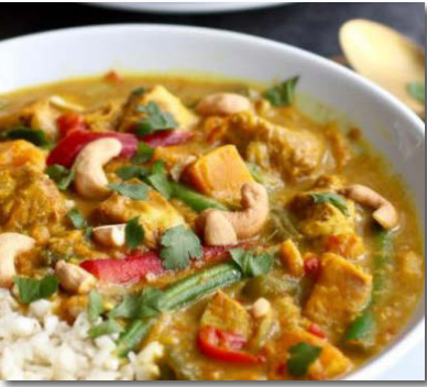
Chicken Sweet Potato Curry